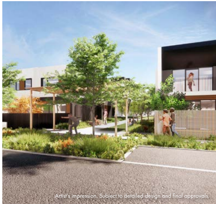
Artist's impression. Subject to detailed design and final approvals.