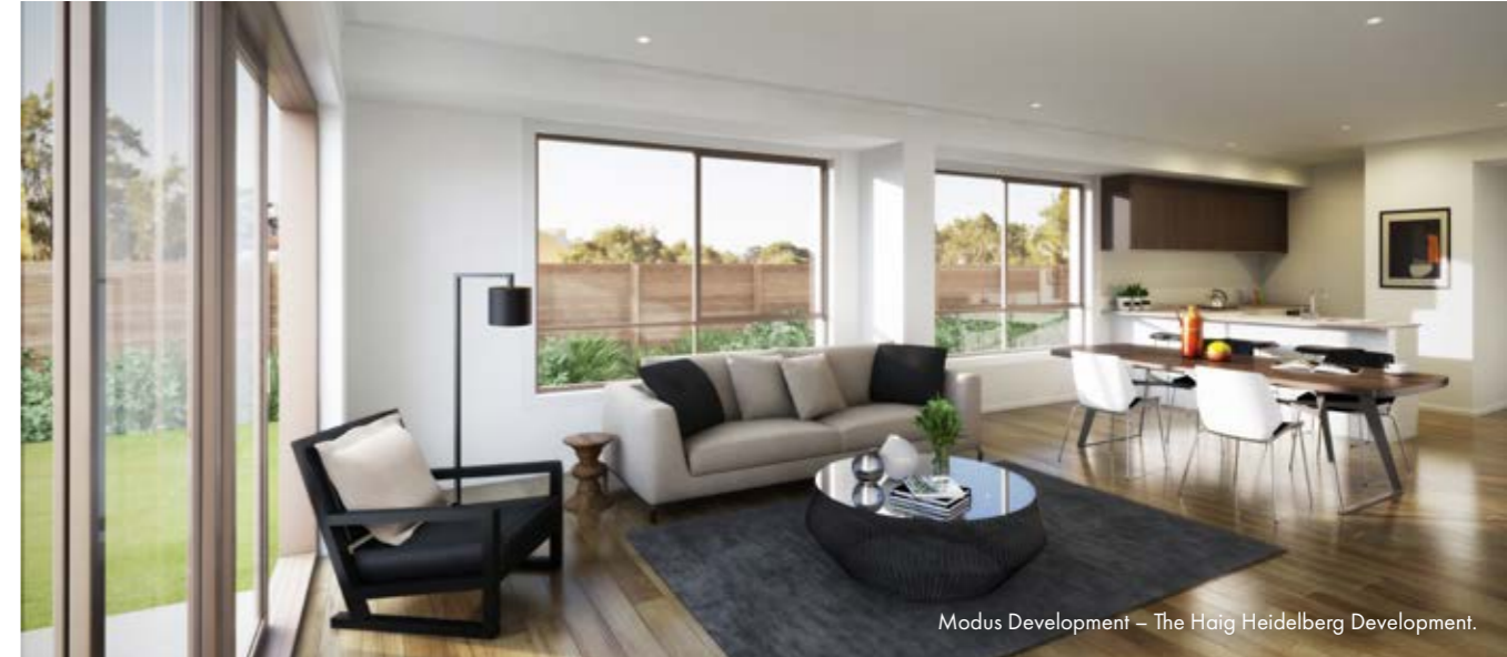
Modus Development – The Haig Heidelberg Development.