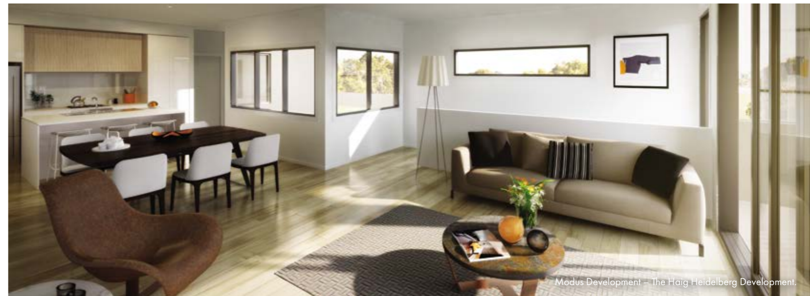
Modus Development – The Haig Heidelberg Development.