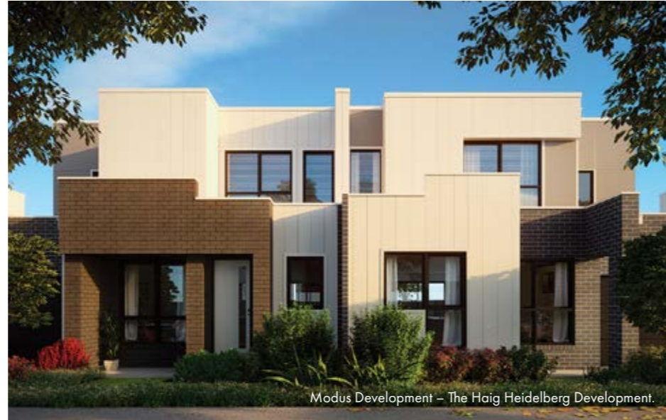
Modus Development – The Haig Heidelberg Development.

Modus Unique Developments is the trusted name behind residential projects marked by a high degree of liveability and exceptional quality. Led by three directors with more than 120 years of combined experience, the entire team is driven by a vision to create new homes and new communities which deliver superb lifestyle choices, each in carefully selected locations. Known for in-fill masterplanned projects which add to the fabric of local communities, Modus Unique Developments works with selected partners to ensure its vision is realised, and will provide enduring value for purchasers.