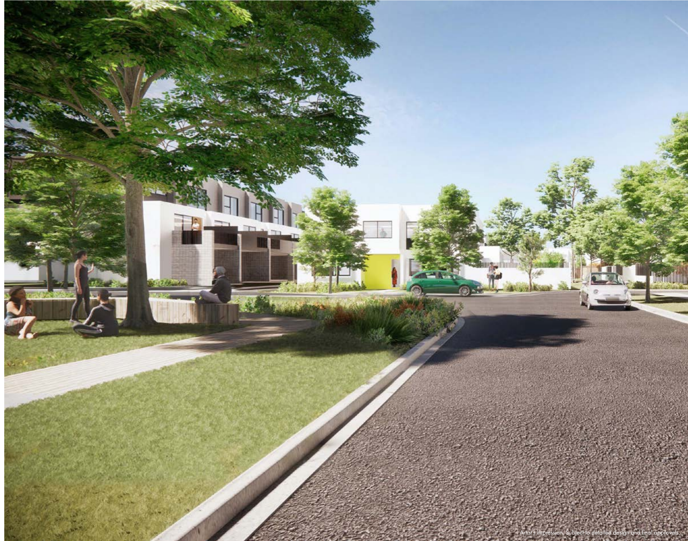
Artist's impression. Subject to detailed design and final approvals.