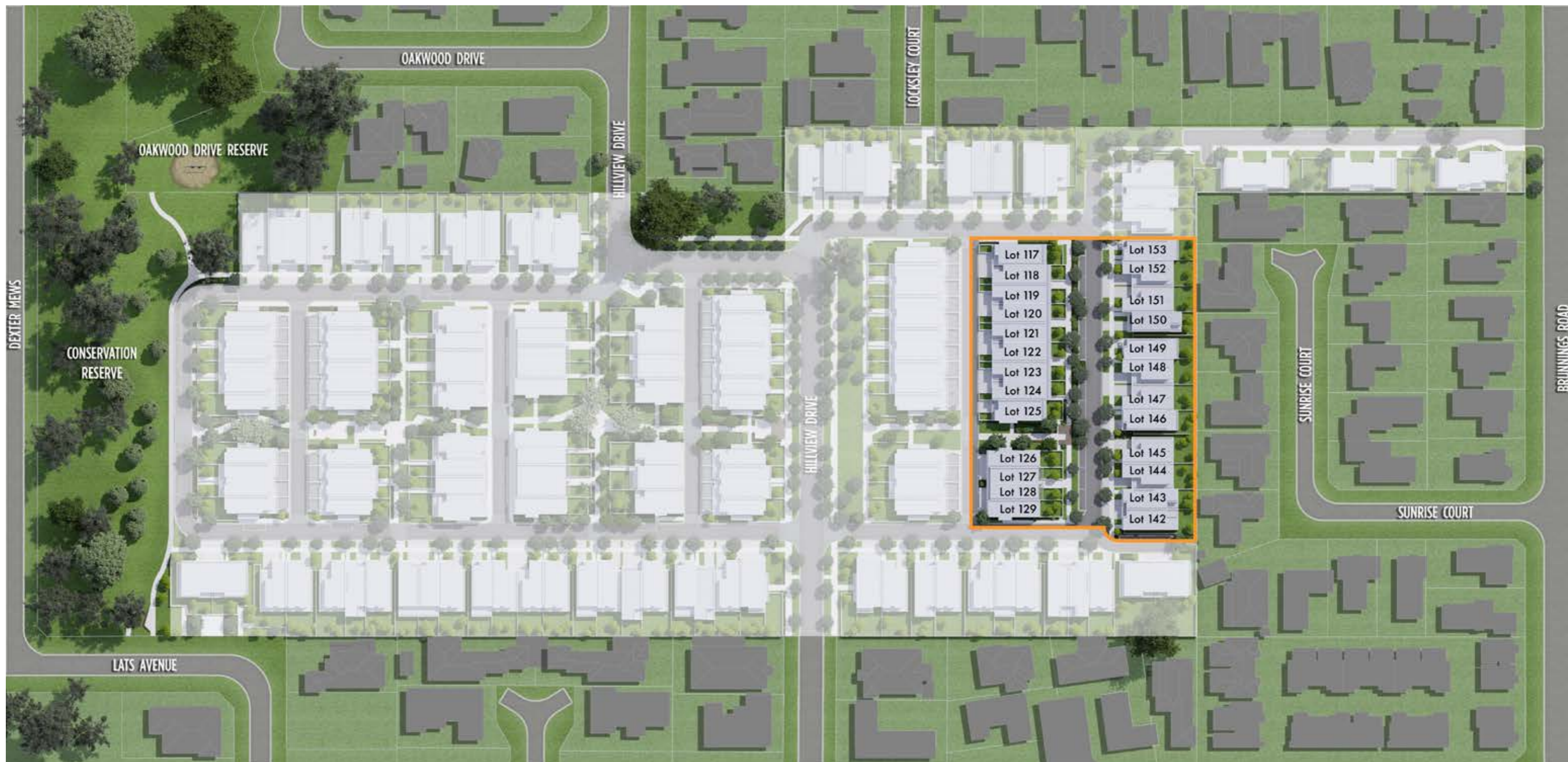
Artist's impression. Maps and illustrations in this brochure are intended to be a visual aid only and do not necessarily depict the actual development. All information is subject to change without notice.