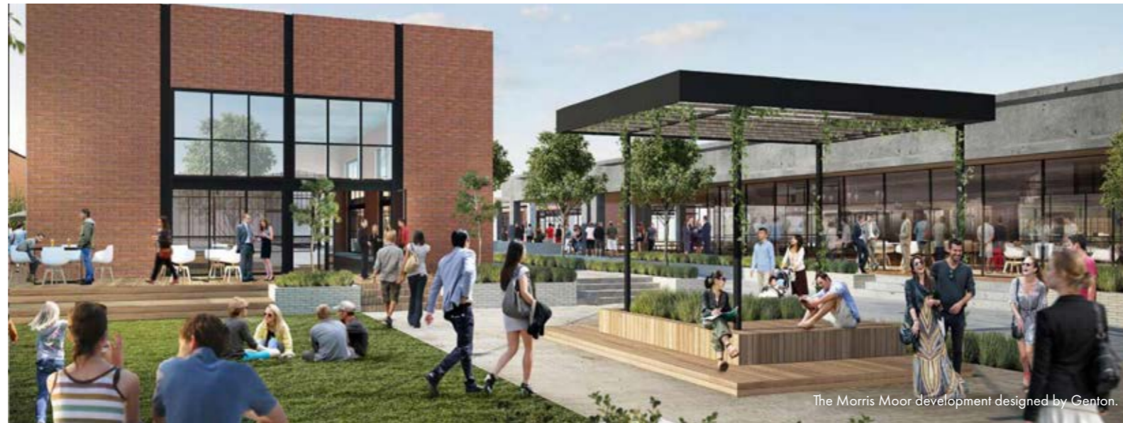
The Morris Moor development designed by Genton.

The Genton team are committed to achieving smart and sustainable design, crafting bespoke interiors to compliment the end user's lifestyle and create a feeling of home in residential projects. Notable recent residential projects include the award-winning North Avoca Beachfront Residences, as well as Townhaus Apartments, West Melbourne.