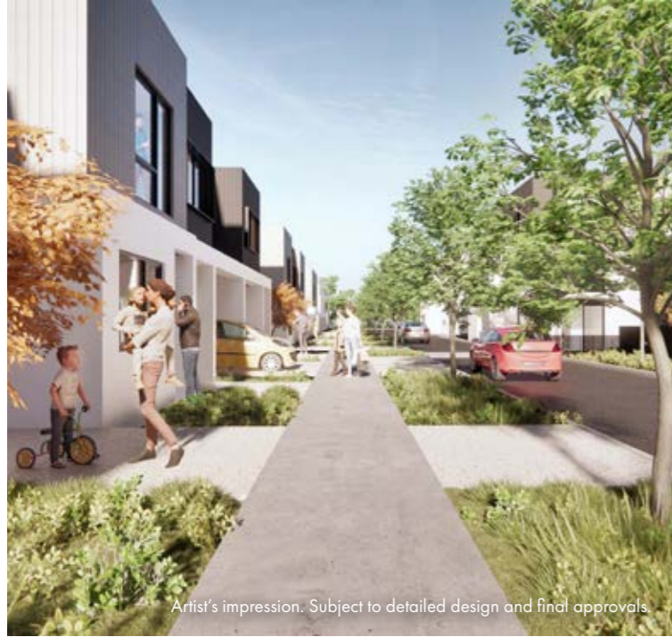
Artist's impression. Subject to detailed design and final approvals.

Modern living isn't about one size fits all. A vibrant and thriving community is built on a diverse neighbourhood where there's something for everyone. Sandford will offer a great range of townhomes that you can make your own. Four, three and two bedroom floorplans with a mixture of two and three storey configurations will be available. Plus each townhome will be fixed price, there are no extra costs or add-ons, everything will be up-front, the way it should be. So no matter what your needs, you'll find a townhome to suit your modern lifestyle.